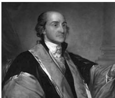
John Jay, first Chief Justice of the U.S. Supreme Court, appointed by George Washington in 1789.