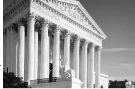
The U.S. Supreme Court.