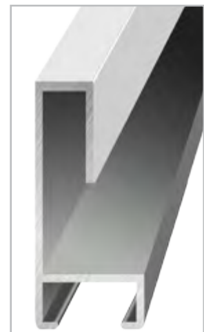
ML129-52 Bright White