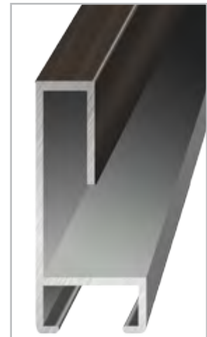
ML129-13 Contrast Grey